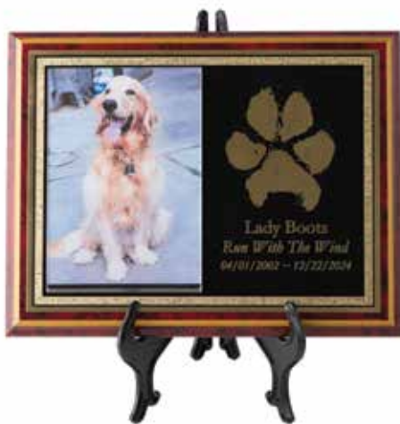
Photo Plaque Memorial: The photo plaque is created in-house by our talented staff, a fitting memorial for your beloved companion.