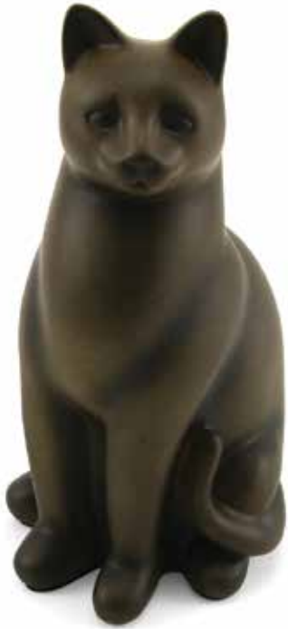
Elite Cat C310 (Sable)

The Elite Cats are crafted of resin and feature a stone fleck finish with colors of sable, fawn, mottled tabby and black. Each cat has a felt-lined bottom with a threaded plug for secure closure.