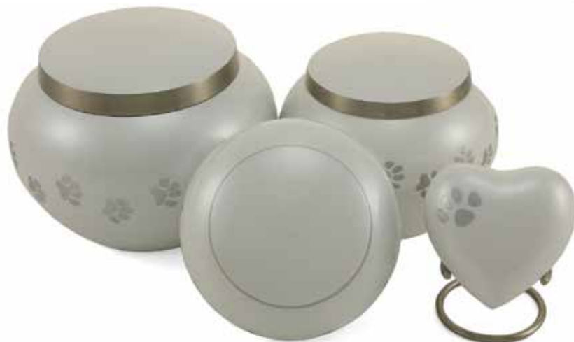
Odyssey Pearl 2922