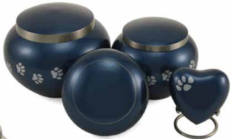
Moonlight Blue 2921